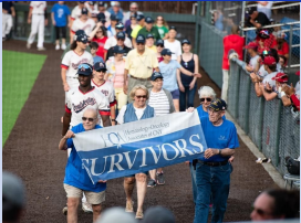
Cancer Survivor Ceremony