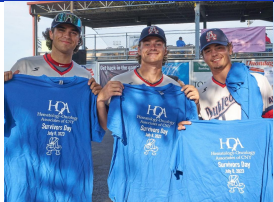
The Doubledays players love supporting our cancer survivors!